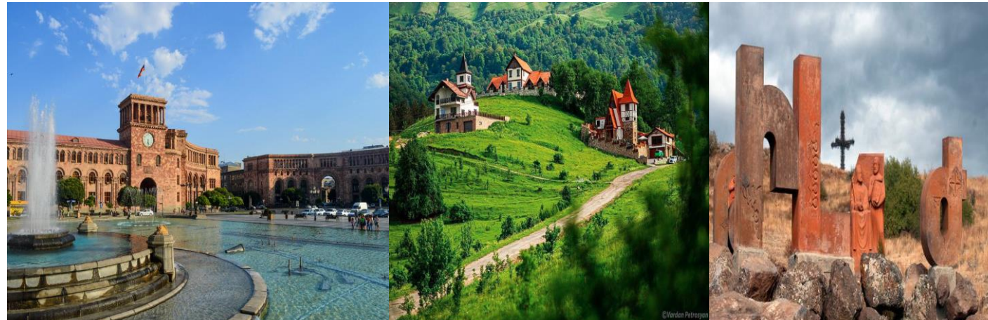
This is a destination where you will be intrigued by history, awed by monuments, amazed by the landscape and charmed by down-to-earth locals... travelling here is as rewarding as it is revelatory".

Trip Highlight Day 2: Yerevan City tour Day 3: Tsakhkadzor - Sevan - Dilijan Day 4: Aragats - Saghmoavank - Alphabet Alley