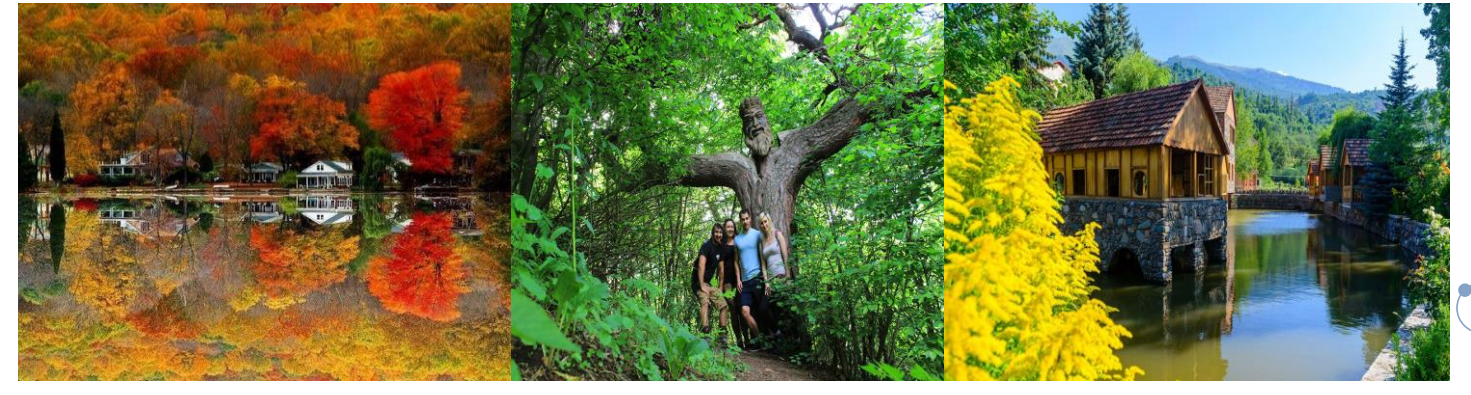
Day 4: ARAGATS TILL SNOW - SAGHMOAVANK - THE ALLEY OF ALPHABET